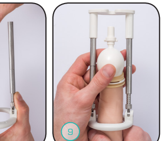
system. Estimate the penis inside the rod length of the system extender system. (your extended penis size + 1.5 cm or .6 in)

Emser Straße 39d · 10719 Berlin, Germany