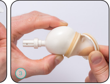
Spread 3-4 drops of Pro-Master fluid to the inside of the latex.

• Turn the glans chamber and pump ball against each other. • Squeeze the pump ball to the limit. • Push the glans softly against the alans chamber.