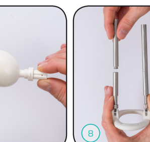
Turn the pump ball counter- Set up the rod extender Insert the engaged clockwise to disengage from the rotary valve. Keep the valve closed.